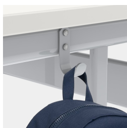
Includes one satchel hook per seat