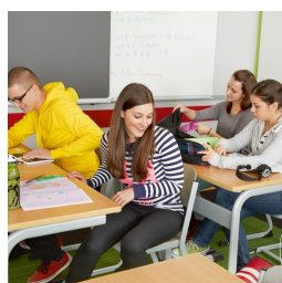
Due to C-shape no disturbance of the table legs when getting in and out of the table