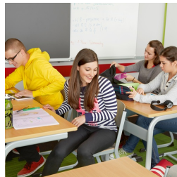
Due to C-shape no disturbance of the table legs when getting in and out of the table