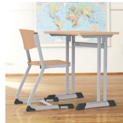
Due to C-shape no disturbance of the table legs when getting in and out of the table