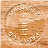
PAGHOLZ® from sustainable forestry