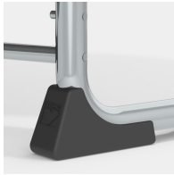
Tilt protection due to special floor protectors