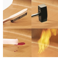
Indestructible PAGHOLZ® shell, scratch, break and impact resistant; flame retardant