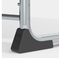
Tilt protection due to special floor protectors