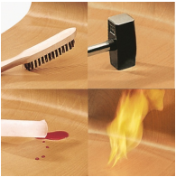
Indestructible PAGHOLZ® shell, scratch, break and impact resistant; flame retardant