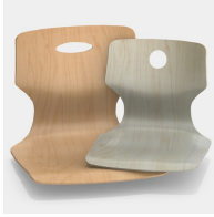
Optionally with grip hole, round or oval