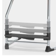
Tool-free adjustment of the footrest with only one hand