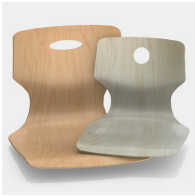
Optionally with grip hole, round or oval