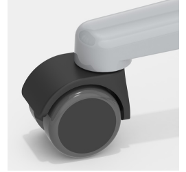
Optionally with load-dependent braked casters