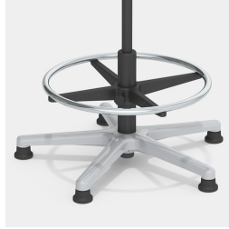
Robust aluminum base with elevation and chrome-plated foot ring, height adjustable