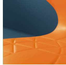
Seat shell with integrated ventilation channel