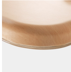
Optional WOODMARK table top in shatterproof quality