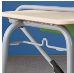
Stacking bar with satchel hooks on both sides