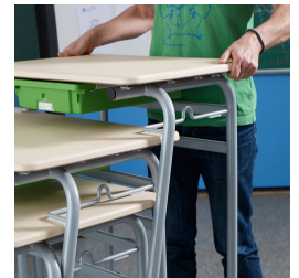
Up to 4 tables stackable, also with accessories