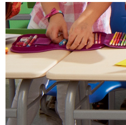
Can be placed next to each other without visible gaps