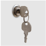
Cupboard with central locking