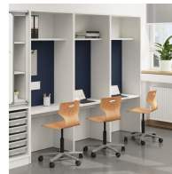
Side panels for better glare and privacy protection