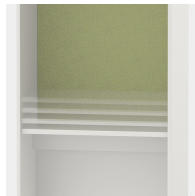
Height-adjustable table top; optional cable aperture