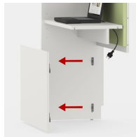
Removable bezel for easy cable routing