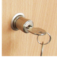
Sliding doors lockable