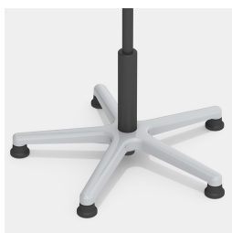
Extremely robust aluminum base