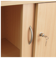
Smooth sliding doors