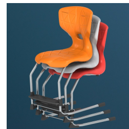
Stackable up to 3 chairs