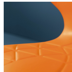
Seat shell with integrated ventilation channel