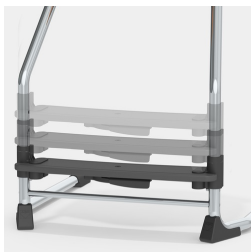
Tool-free adjustment of the footrest with only one hand