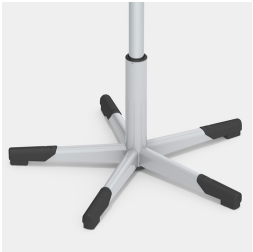
Extremely robust steel base