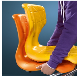
2 chairs stackable and easy to carry due to low weight