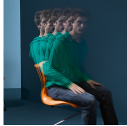
3D movement through Z-frame supports the toning of the muscles