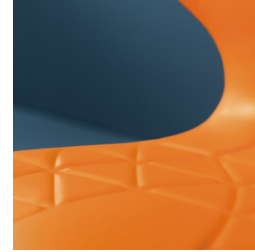
Seat shell with integrated ventilation channel