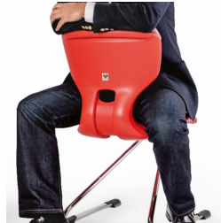
Shell shape allows different sitting positions, including reverse