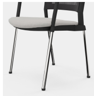
Robust 4-leg frame