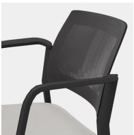
Ergonomically shaped, breathable mesh backrest