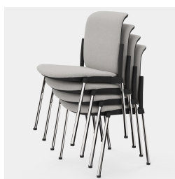
Stackable up to 4 chairs

Our range of materials and colors can be found in the A2S material overview.