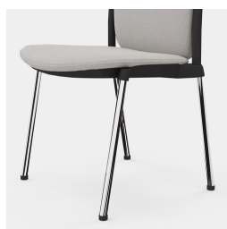
Robust 4-leg frame