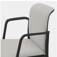
Ergonomically shaped backrest