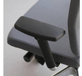
Armrest three-dimensionally adjustable