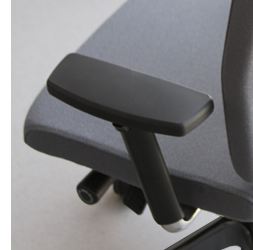
Height adjustable armrests