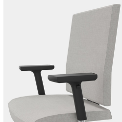
Ergonomically shaped backrest