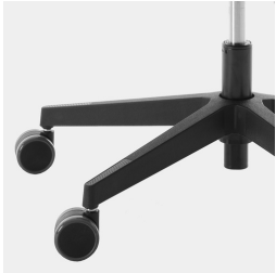
Elegant, sturdy black plastic base