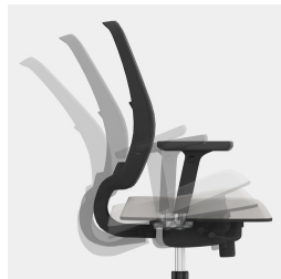
Synchronous mechanism: Spring force or resistance adjustable to body weight