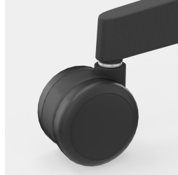
Load-dependent braked safety casters prevent unintentional rolling away