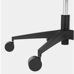
Elegant, sturdy black plastic base