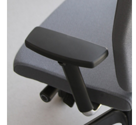
Height adjustable armrests