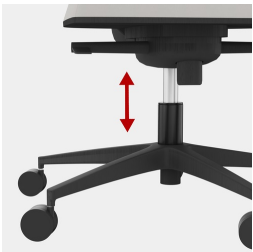
Stepless gas lift height adjustment