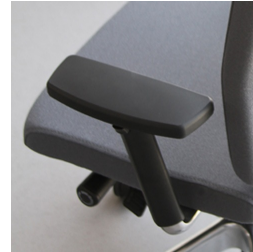
Armrest three-dimensionally adjustable