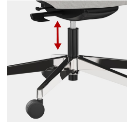
Stepless gas lift height adjustment includes seat depth suspension