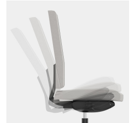
Self-weighting synchronous mechanism automatically adjusts spring force or resistance