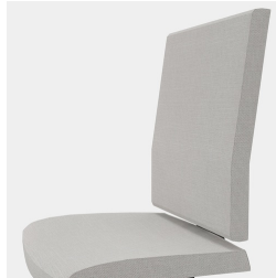
Ergonomically shaped backrest