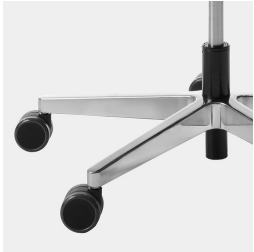
Elegant, high-quality aluminum base