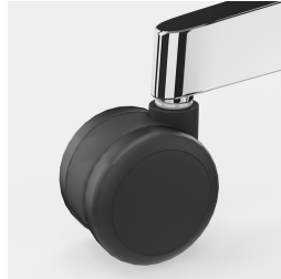
Load-dependent braked safety casters prevent unintentional rolling away