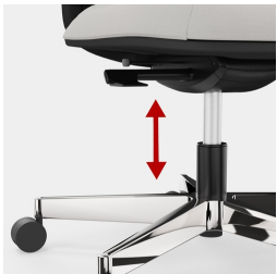
Stepless gas lift height adjustment includes seat depth suspension