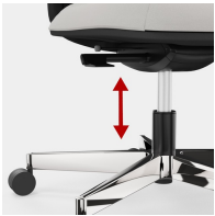
Stepless gas lift height adjustment includes seat depth suspension