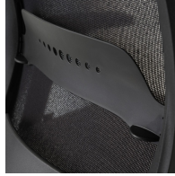
Black mesh backrest, with lumbar support adjustment