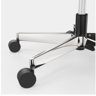
Elegant, high-quality aluminum base