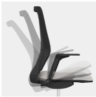
Self-weighting synchronous mechanism automatically adjusts spring force or resistance