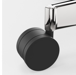
Load-dependent braked safety casters prevent unintentional rolling away