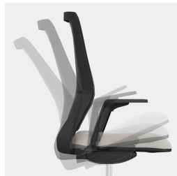
Self-weighting synchronous mechanism automatically adjusts spring force or resistance