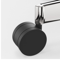
Load-dependent braked safety casters prevent unintentional rolling away