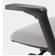
Armrest three-dimensionally adjustable