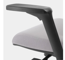
Armrest three-dimensionally adjustable