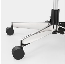
Elegant, high-quality aluminum base