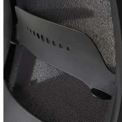
Black mesh backrest, with lumbar support adjustment