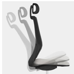
Self-weighting synchronous mechanism automatically adjusts spring force or resistance