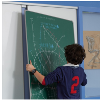
Removable board elements