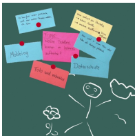
Magnetic surface can be written on with chalk