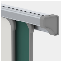
Plastic caps prevent accidental ejection