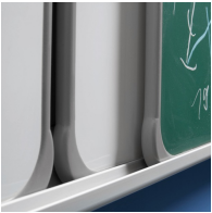
Board elements with ASSODUR® edge can be moved one behind the other