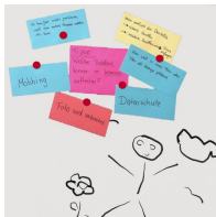
Magnetic surface can be written on with whiteboard pens