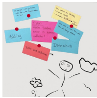
Magnetic surface can be written on with whiteboard pens