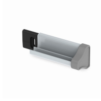
Invisible rail fastening compensates for wall unevenness