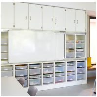
Can be mounted on cabinet wall