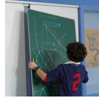
Removable board elements