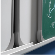
Board elements with ASSODUR® edge can be moved one behind the other