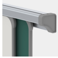
Plastic caps prevent accidental ejection