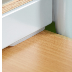
Plate protectors protect the table when stacking