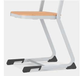
Stable and solid C-shape frame