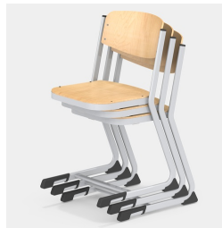
Stackable up to 3 chairs (size 7)