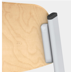
Seat and back concealed screwed