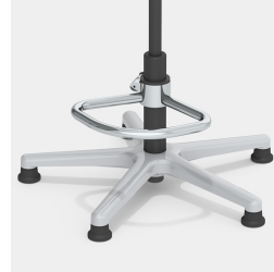
Optionally with partial foot ring