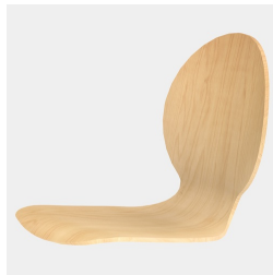
Body contoured seat shell