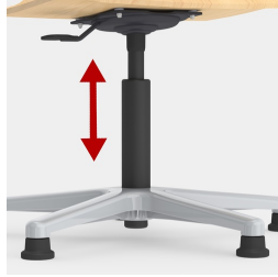
Height adjustment by safety gas spring