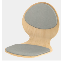
Optionally with seat and backrest upholstery