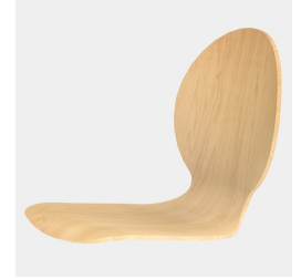
Body contoured seat shell