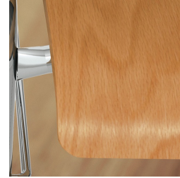
Seat shell environmentally friendly lacquered with water-based varnish