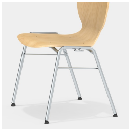
Robust 4-leg frame