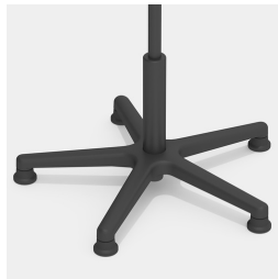
Extremely robust black plastic base