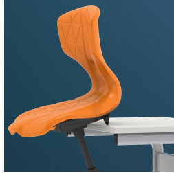
Table suspension protects the table when it is stacked