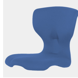
Optional seat shell fully upholstered from size 5 onwards