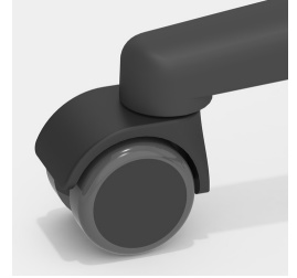
Optionally with load-dependent braked casters