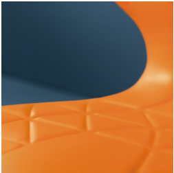
Seat shell with integrated ventilation channel