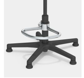
Optionally with partial foot ring