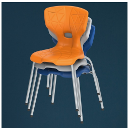
Stackable up to 3 chairs (without upholstery)