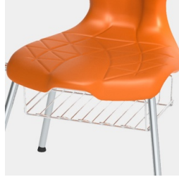
Optionally with book tray from size 5