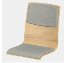
Optionally with seat and backrest upholstery