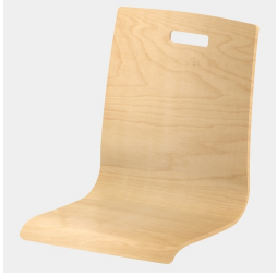
Optionally with rectangular grip hole (not with backrest upholstery)