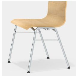
Robust 4-leg frame