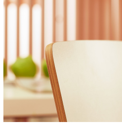
Seat shell optionally coated with scratch-resistant multiplex finish