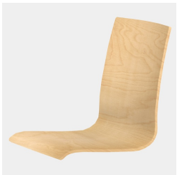
Body contoured seat shell