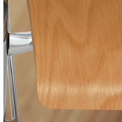
Seat shell environmentally friendly lacquered with water-based varnish