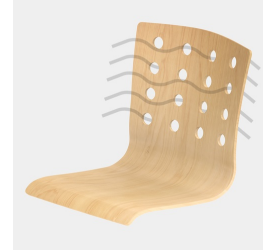
Seat shell with round cut-outs ensures optimum air circulation