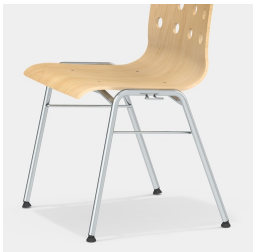
Robust 4-leg frame