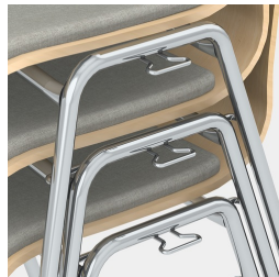
Stackable up to 9 chairs (with or without seat upholstery)