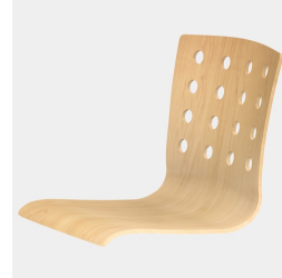
Body contoured seat shell