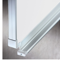
Matching shelf for chalk and pens