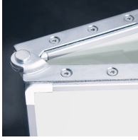
Panel wings can be folded out at 180° angle