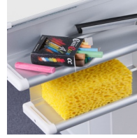
Eraser and pen tray included