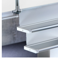
Edge protection due to rounded safety corners