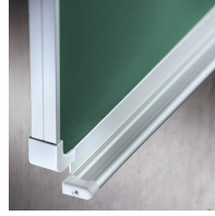
Matching shelf for chalk and pens