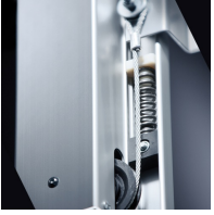
Maintenance-free, low-noise precision guidance on 8 ball-bearing track rollers