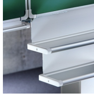
Edge protection due to rounded safety corners