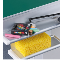
Eraser and pen tray included