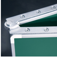
Panel wings can be folded out at 180° angle