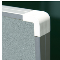
Edge protection due to rounded safety corners