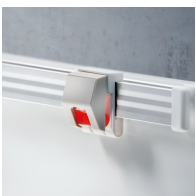
Optionally with picture clamping bar