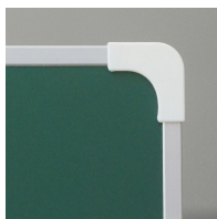
Edge protection due to rounded safety corners