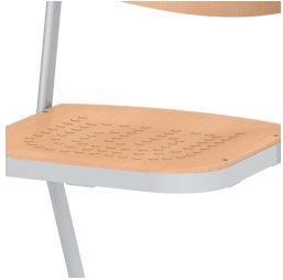
Seat surface with pressed-in, anti-slip knobs