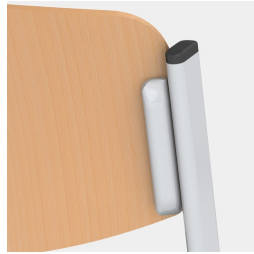
Seat and back concealed screwed