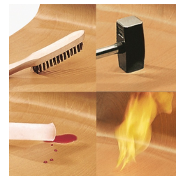
Seat and back melamine coated: scratch, break and impact resistant; flame retardant