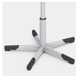
Extremely robust steel base