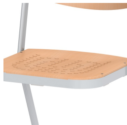
Seat surface with pressed-in, anti-slip knobs