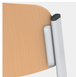
Seat and back concealed screwed