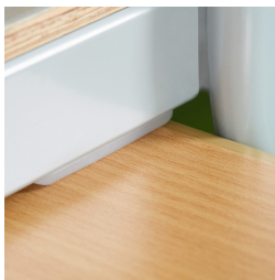
Plate protectors protect the table when stacking