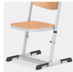
Stable, height-adjustable sled frame