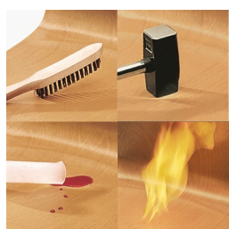
Seat and back melamine coated: scratch, break and impact resistant; flame retardant