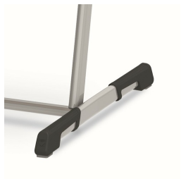
Floor protectors with integrated step protection